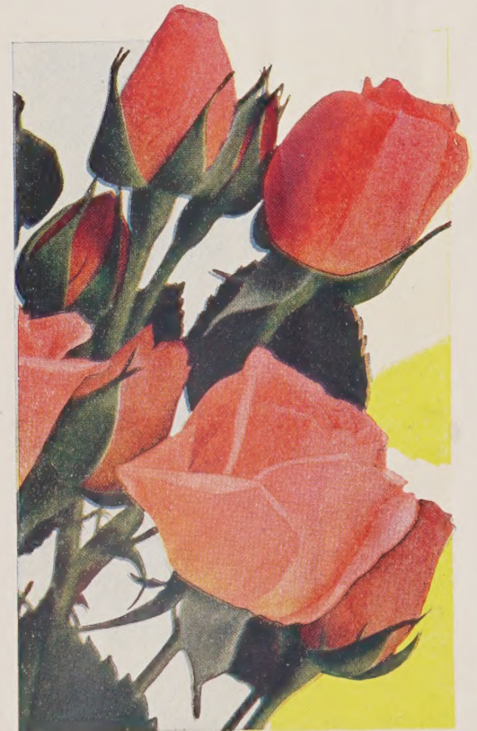
PINOCCHIO (Plant Pat. No. 484)